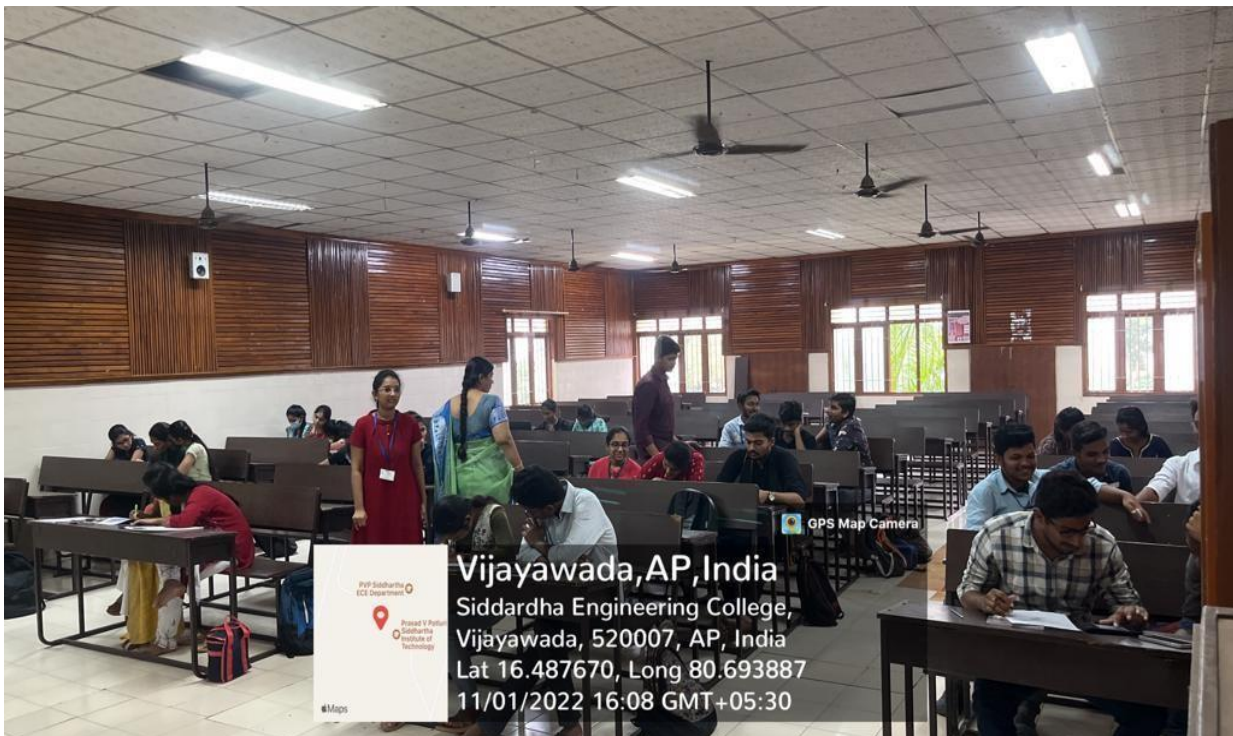
Faculty and student coordinators monitoring students.